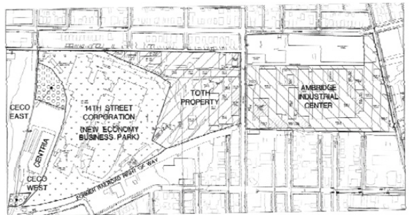
The three main areas of the site.

- Ambridge Industrial Center (former H.K. Porter Company, Inc. and National Electric Division property) occupying approx. the southern third of the site between 14th and 11th Streets