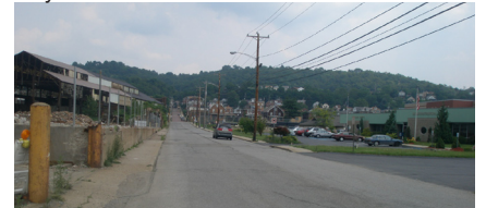
Demolition of factory along 11th Street, across from Ambridge Municipal building. Before & After photos courtesy of http://www.ambridgeboro.org