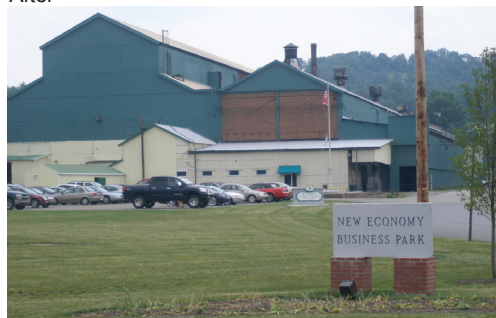
The north end of the old H.H. Robertson property across from the old Foodland. 'Before' picture courtesy of Silk House Cafe.