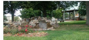
Water element installed in PJ Caul Park

and the primary means of local transportation was muscle-powered. This means that the streets are fairly narrow with short blocks. Route 989/Duss Street is wide enough to accommodate turns by large trucks. There are a number of one-ways streets, too. While this is advantageous from pedestrian design perspectives, these qualities hinder easy truck access to the Toth site and other properties within the industrial district.